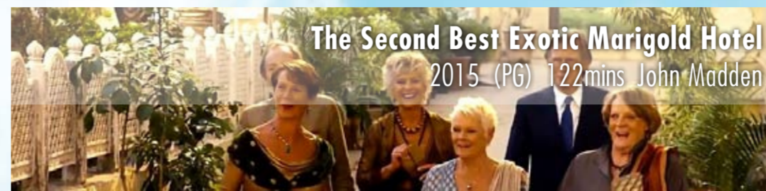
The Second Best Exotic Marigold Hotel 2015 (PG) 122mins John Madden

A special afternoon kids' screening about the loveable Peruvian bear's life in London with the kindly Brown family. Join us as we watch Paddington on his adventures (and of course his marmalade sandwiches!). Bring along your family and your favourite teddy bear.