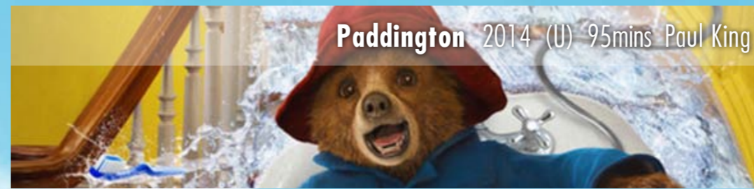
Paddington 2014 (U) 95mins Paul King